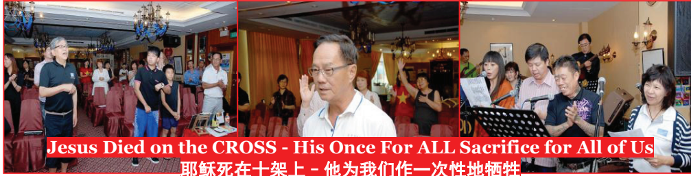
Jesus Died on the CROSS - His Once For ALL Sacrifice for All of Us 耶稣死在十架上 - 他为我们作一次性地牺牲

We Were NOT There But We Believe 我们不在现场但我们相信 Our Savior Dead For Our Sins 我们救主为我们的罪而牺牲