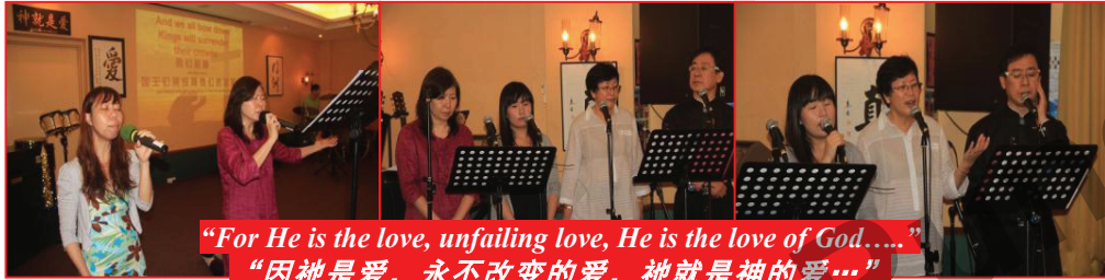
"For He is the love, unfailing love, He is the love of God...." "因祂是爱, 永不改变的爱, 祂就是神的爱..."