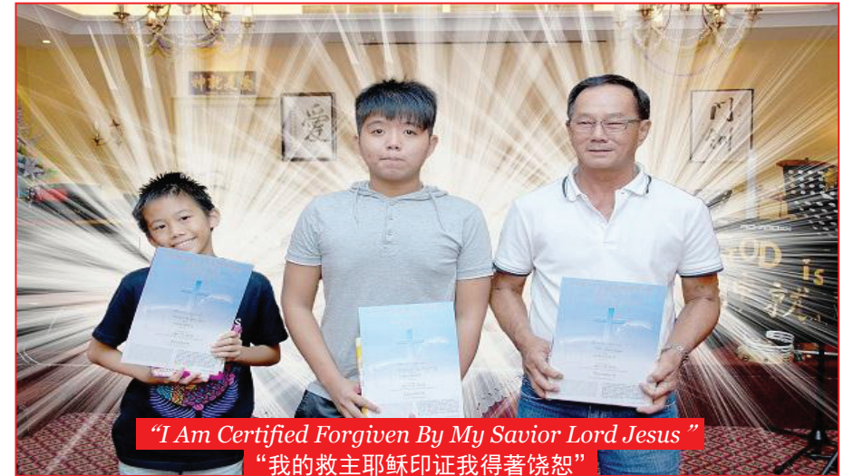
"I Am Certified Forgiven By My Savior Lord Jesus" "我的救主耶稣印证我得饶恕"