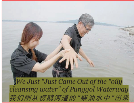
We Just "Just Came Out of the "oily cleansing water" of Punggol Waterway 我们刚从榜鹅河道的“柴油水中”出来