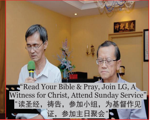
"Read Your Bible & Pray, Join LG, A Witness for Christ, Attend Sunday Service" "读圣经, 祷告, 参加小组, 为基督作见 证, 参加主日聚会"