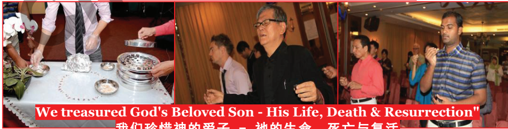
We treasured God's Beloved Son - His Life, Death & Resurrection" 我们珍惜神的爱子 - 祂的生命, 死亡与复活